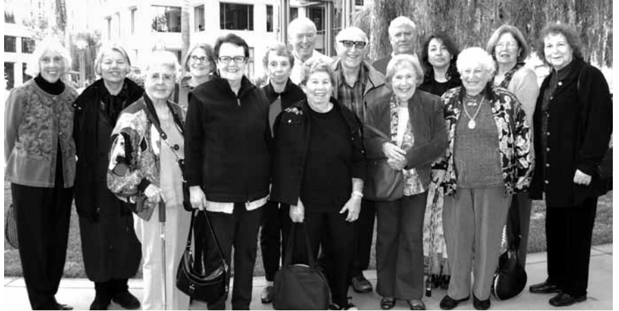
Fraud fighter volunteers gathered to celebrate four years of warning others about financial scams and rip-offs.

Four years ago, with a grant funded by the AARP Foundation, WISE & Healthy Aging launched the WISE Senior Fraud Prevention Call Center – one of only seven telemarketing fraud prevention call centers in the country.