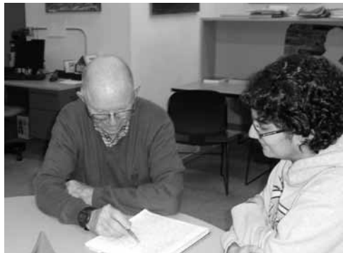
College students get individualized tutoring from volunteers.