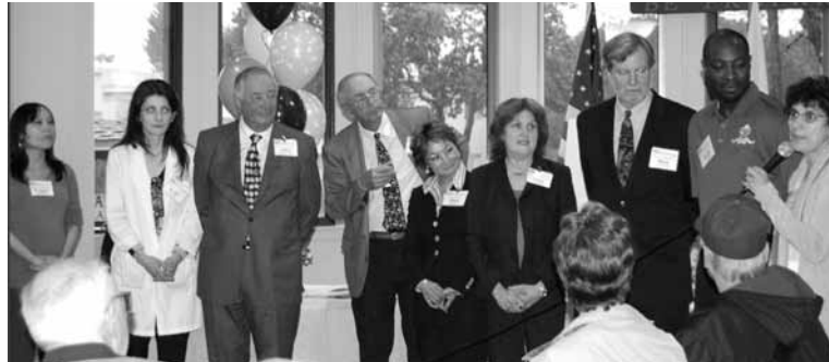
An impressive panel of professionals participated at the Mar Vista ‘Open House’ and highlighted the benefits of a WISE Connections membership.

Mar Vista and Santa Monica WISE Connections, a “village” program with the goal of helping older adults to live in their homes independently, each hosted successful launch parties recently, with nearly 100 older adults and their families coming out for each event.